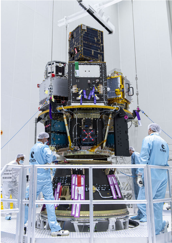
The ESAIL satellite prior to encapsulation.

The ESAIL microsatellite for tracking ships worldwide—developed under an ESA Partnership Project—has completed its accommodation on Vega's new dispenser for small satellites and is ready for launch.