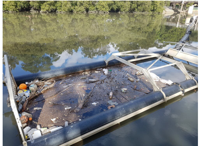
Litter caught in a trap in Cooks River. These traps aren't effective at catching microplastic.

And in regional areas, microplastics may be washing in from agricultural soils. Sewage sludge is often applied to soils as it is rich in nutrients, but the same sludge is also rich in microplastics.