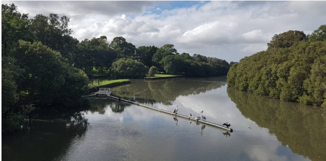
A litter trap in Cook's River.

Each year the ocean is inundated with 4.8 to 12.7 million tonnes of plastic washed in from land. A big proportion of this plastic is between 0.001 to 5 millimetres, and called "microplastic".