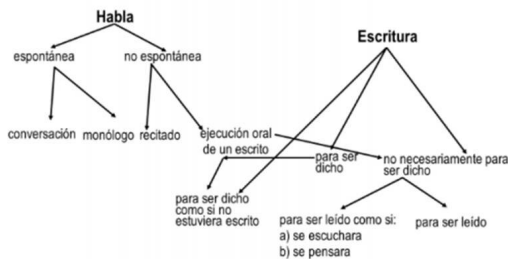
Figura 1. Propuesta de clasificación de textos formulada por Gregory y Carroll (1978).

Traditional text classification proposal.