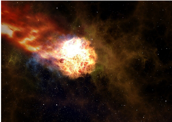
Artist's impression of a supernova.