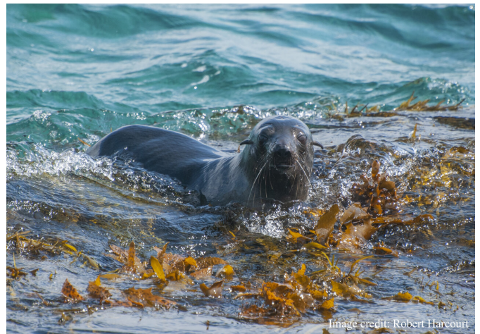
New Zealand fur seal playing in Kelp.

was seen poking through the seal's cheek, prompting the researchers to CT scan the seal using the cutting-edge facilities at Monash Biomedical Imaging.