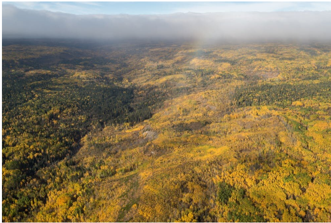
Boreal forest landscape within the Birch Mountains of Alberta, an area identified as a high priority for conservation in a changing climate.