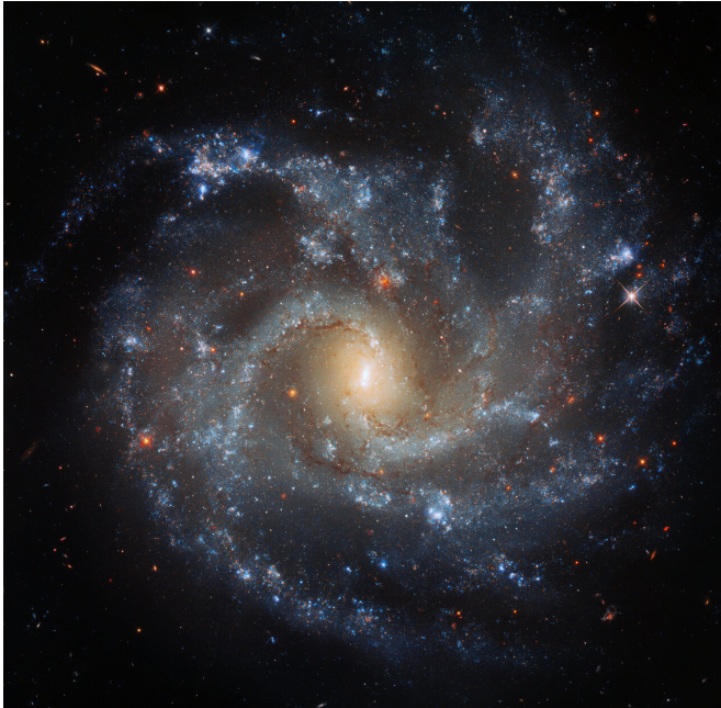
Spiral galaxy NGC 5468, 130 million light-years away.

Using data from the CALIFA Integral Field Spectroscopy (IFS) survey and advanced modeling tools, researchers from Instituto de Astrofísica e Ciências do Espaço (IA) have obtained important results about the central spherical component (the bulge) in spiral galaxies like the Milky Way, shedding new light on the understanding of galactic evolution. The results are published in the latest issue of Astronomy & Astrophysics .