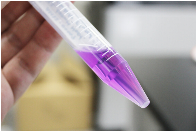
Purified schizorhodopsin protein in water solution.

Researchers investigated the group of microorganisms classified as Asgard archaea , and found a protein in their membrane which acts as a miniature light-activated pump. The schizorhodopsin protein draws protons into the organisms' body. This research could lead to new biomolecular tools to control the pH in cells or microorganisms, and possibly more.