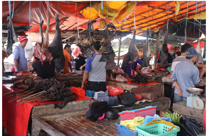
Dead bats for sale hang in an Indonesian market.

Threatened and endangered species also tend to be highly managed and directly monitored by humans trying to bring about their population recovery, which also puts them into greater contact with people. Bats repeatedly have been implicated as a source of "high consequence" pathogens, including SARS, Nipah virus, Marburg virus and ebolaviruses, the study notes.