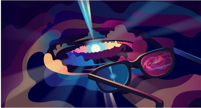
3D glasses.

A team of researchers from Russia and Greece reports a way to determine the origins and nature of quasar light by its polarization. The new approach is analogous to the way cinema glasses produce a 3-D image by feeding each eye with the light of a particular polarization, either horizontal or vertical. The authors of the recent study in the Monthly Notices of the Royal Astronomical Society managed to distinguish between the light coming from different parts of quasars—their disks and jets—by discerning its distinct polarizations.