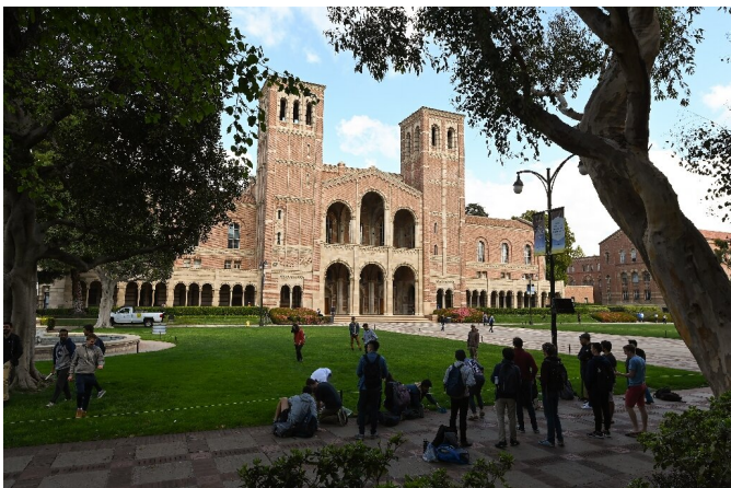
Students gather on the campus of University of California at Los Angeles (UCLA) in Los Angeles, among the schools suspending in-person classes due to coronavirus concerns

"Students who do not have access to the internet from home or are dependent on a cell phone for access perform lower on a range of metrics, including digital skills, homework completion, and grade point average," said a Michigan State University study released this month.