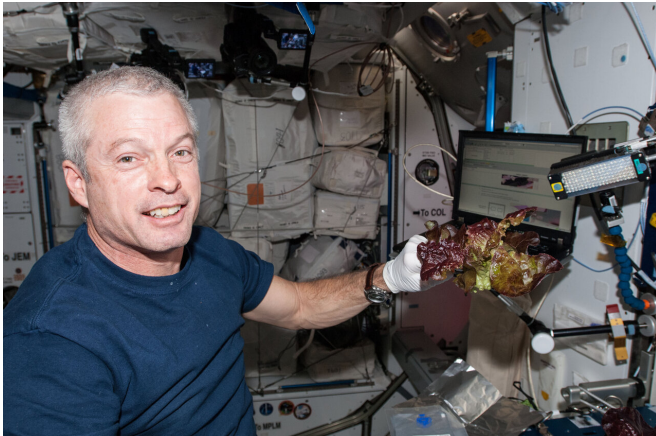
Astronaut Steve Swanson harvests some of the crop in June 2014.

Astronauts in space live on processed, pre-packaged space rations such as fruits, nuts, chocolate, shrimp cocktails, peanut butter, chicken, and beef to name a few. These have often been sterilized by heating, freeze drying, or irradiation to make them last and key a challenge for the US Space Agency NASA has been to figure out how to grow safe, fresh food onboard.