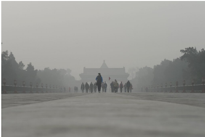
Last year, 117 of the 200 most polluted cities in the world were in China

Nearly 90 percent of the 200 cities beset by the world's highest levels of deadly micro-pollution are in China and India, with most of the rest in Pakistan and Indonesia, researchers reported Tuesday.