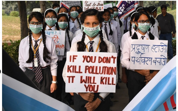
Indian school children march to raise awareness about air pollution levels in New Delhi

Among the club of 36 rich OECD nations, South Korea was the most polluted for PM2.5, counting 105 of the worst 1,000 cities on the index. In Europe, Poland and Italy count 39 and 31 cities, respectively, in this tranche.