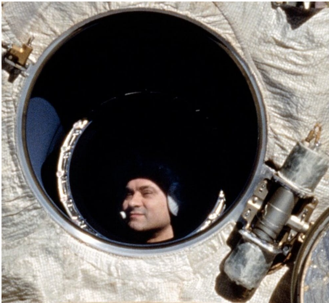
Russian cosmonaut Valeri Polyakov holds the record for the longest spaceflight. Polyakov spent 438 days in space, returning to Earth on March 22, 1995.

Given what we know about human sexuality , this position seems irresponsible. It prevents research from examining basic questions about sexual health and well-being in space. For instance, how do we deal with hygiene and the messiness of human sex in zero-gravity? How will we maintain a crew's psychological well-being if people must endure long periods lacking in erotic stimulation and affection? Is imposed abstinence a reasonable solution, based on empirical evidence?