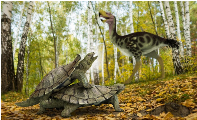
A reconstruction of Lurasichersis relict which lived in the northern hemisphere 66 millions years ago.

Sixty-six million years ago, in the emerged lands of Laurasia—now the northern hemisphere—a primitive land tortoise, measuring about 60 cm, managed to survive the event that killed the dinosaurs. It was the only one to do so in this area of the world, according to a Spanish palaeontologist who has analysed its peculiar fossils, found in France.