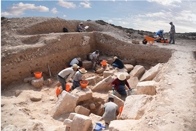
German and Tunisian archaeologists uncover the remains of the Roman bathhouse of Meninx.