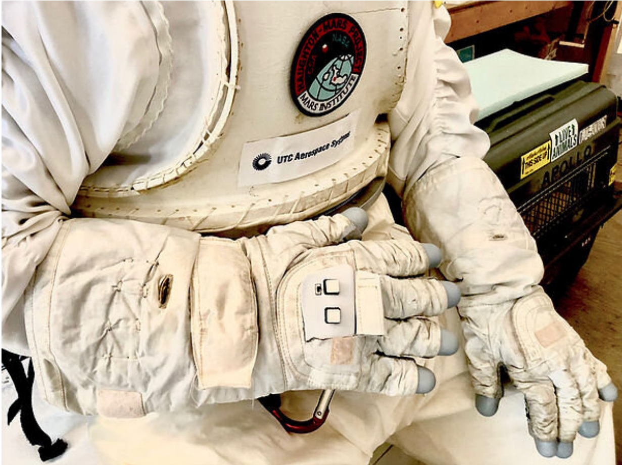
The smart glove prototype.

"The sensors capture even subtle motions of the hand and fingers and wirelessly transfer them to a mobile device that controls the drone or any other robot.