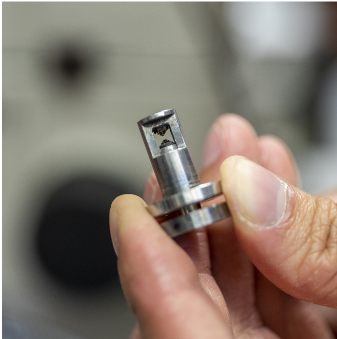
A diamond anvil cell. By compressing a sample between these two opposing anvils, pressures greater than the center of the Earth can be achieved.

In the case of gadolinium, the researchers took a different approach. In particular, the electrons inside gadolinium "happily whiz around in random directions," and this chaotic "mosh pit" of electrons generates a fluctuating magnetic field that the NV sensor can measure, Hsieh said.