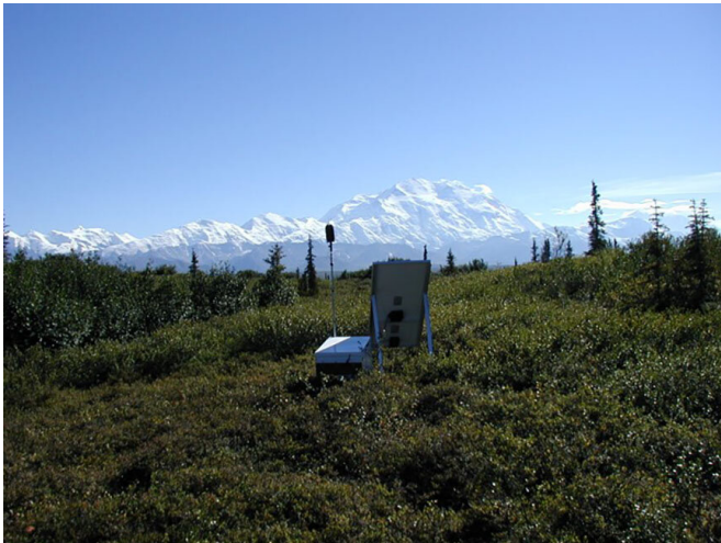
NPS acoustic monitoring site.

National Park Service scientists analyzed nearly 1 million 10-second audio recording samples from national parks across the country and discovered a small increase in bird sound detection when an aircraft sound is also detected.