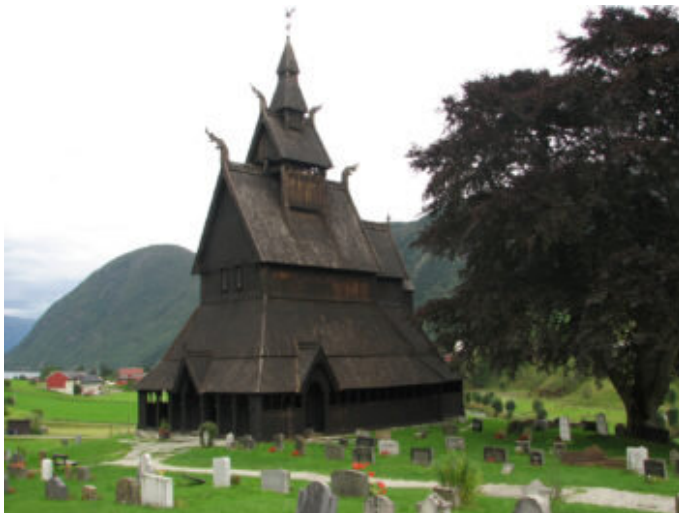
Hopperstad Stave Church in Sogn og Fjordane county is dendro-dated to 1131-1132. Previously, the date was estimated at 1125-1250.