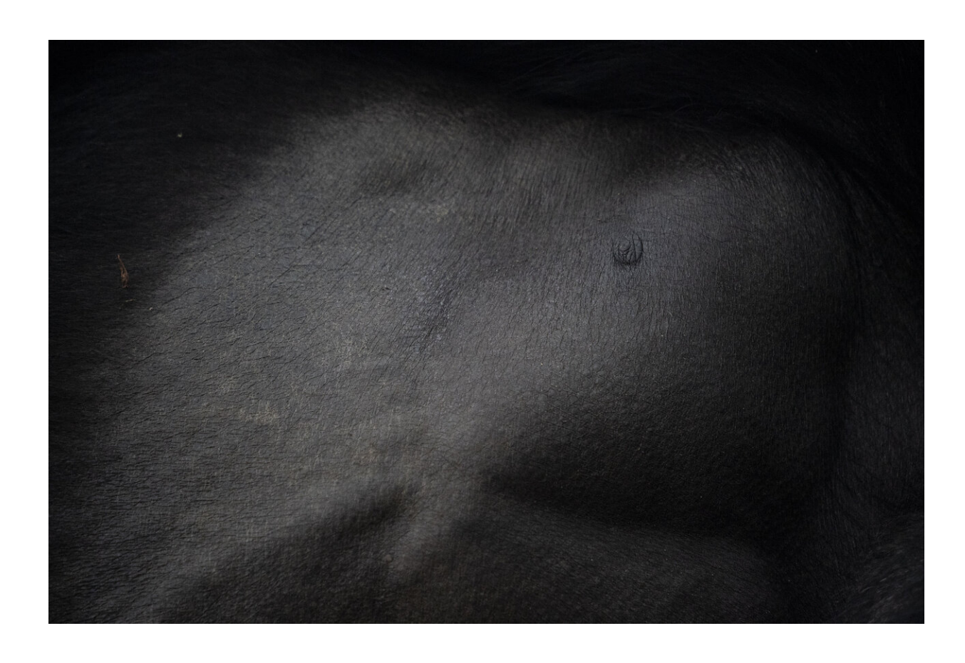
This Sept. 2, 2019 photo shows a closeup of the chest of a silverback mountain gorilla named Segasira as he rests in the Volcanoes National Park, Rwanda.

The school has new classrooms with blackboards and wooden benches, and a colorful mural outside the bathroom reads "Washing hands prevents diseases." But the school is still short on some basic supplies, like pencils.