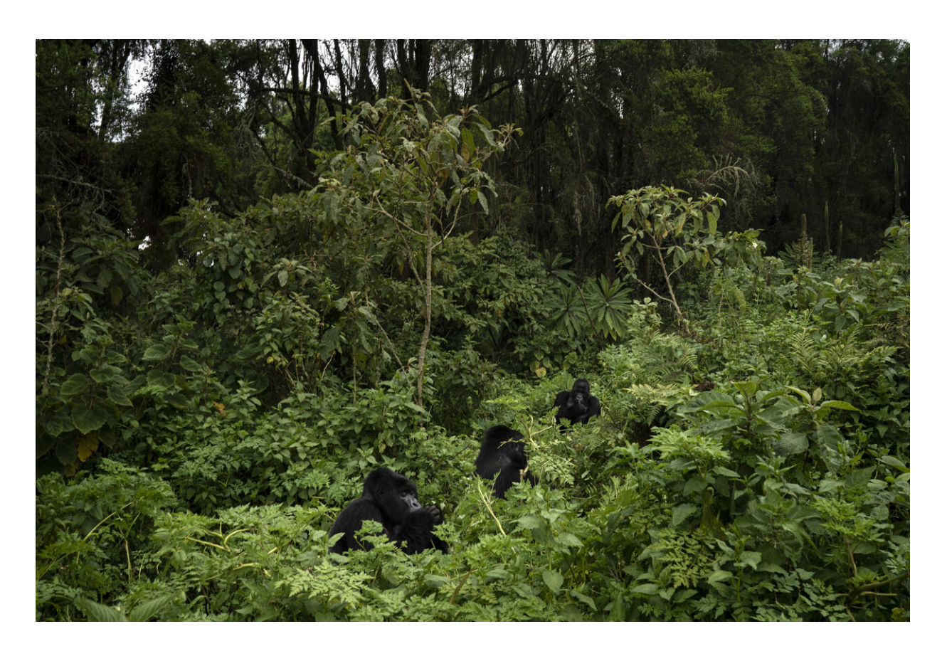
In this Sept. 2, 2019 photo, Urwibutso, Segasira and Pato, three silverback mountain gorillas eat plants in the Volcanoes National Park, Rwanda. Gorillas are languid primates that eat only plants and insects, and live in fairly stable, extended family groups.