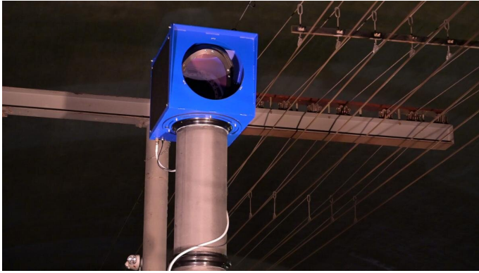
A two-kilowatt laser transmitter atop a 13-foot-high tower, part of the long-range, free-space power beaming system.

The most notable aspect of the demonstration, however—according to Jaffe and Nugent—was the technology's integrated safety systems. No one in the test facility that day was wearing laser safety goggles or any other kind of safety gear, including the personnel operating the system. To put that in perspective, a typical laser of just 1/2 watt requires protective eyewear.