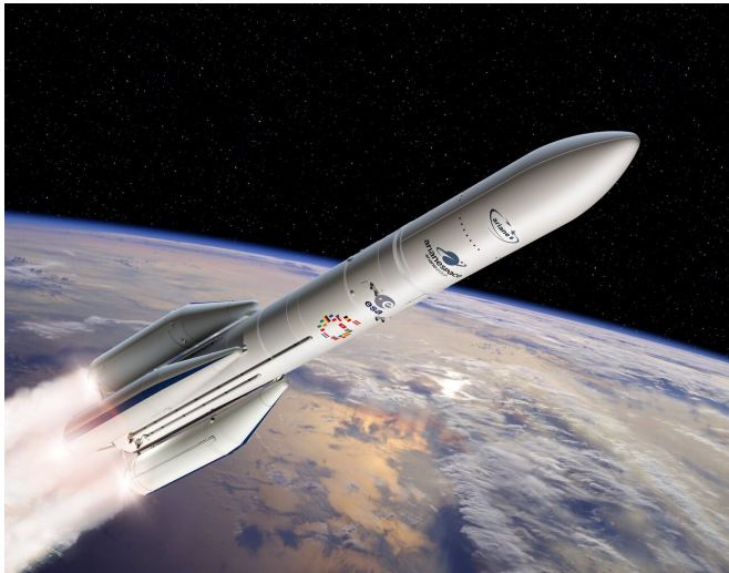
Artist's view of the configuration of Ariane 6 using four boosters (A64).

Ariane 6, Europe's next-generation launch vehicle, has passed another key development milestone. Its Vulcain 2.1 liquid-fueled engine has now completed its qualification testing, which means combined tests can now begin.