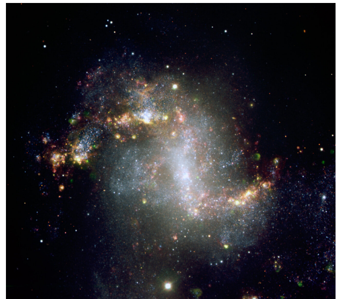
This image, taken with the European Southern Observatory's Very Large Telescope, shows the central region of galaxy NGC1313. This galaxy is home to the ultraluminous X-ray source NCG1313X-1, which astronomers have now determined to be an intermediate-mass black hole candidate. NGC1313 is 50,000 light-years across and lies about 14 million light-years from the Milky Way in the southern constellation Reticulum.

One clue that intermediate-mass black holes could still be out there came from the National Science Foundation's Laser Interferometer Gravitational-Wave Observatory (LIGO), a collaboration between Caltech and the Massachusetts Institute of Technology. LIGO detectors, combined with a European facility in Italy named Virgo, are turning up many different mergers of black holes through ripples in space-time called gravitational waves.