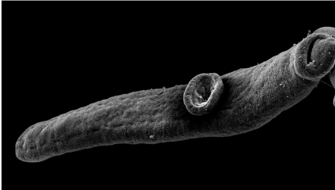
A juvenile blood fluke. Schistosomiasis infection can lead to liver cirrhosis, among others.

A team at the Technical University of Munich (TUM) has completed the first study of the effects of a simultaneous infection with blood flukes (schistosomes) and the bacterium Helicobacter pylori —a fairly common occurrence in some parts of the world. They identified a complex interaction which resulted—among other effects—in a weakening of the adverse impact of the pathogens acting individually.