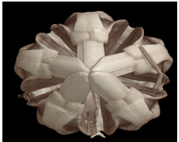
Five sea urchin tooth tips stacked atop one another within the jaws.

In the new study, Espinosa and colleagues combined sophisticated mechanical testing and electron microscopy to capture 3-D movies showing how the urchin's teeth wear. Their studies show that the teeth consist of ceramic composites arranged in a precise way. On the convex side of the tooth, calcite fibers provide structural integrity. This fibrous composite transitions to another composite made of inclined calcite plates on the convex side of the tooth. As the tooth wears, those calcite plates chip away to maintain sharpness.