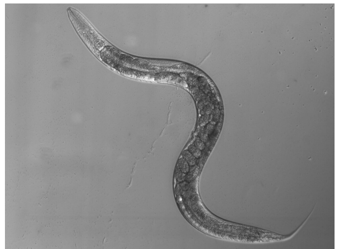
The threadworm C. elegans.