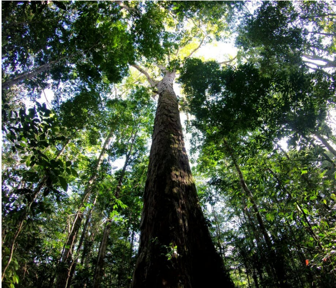
The Amazon's new record-breaking tree.