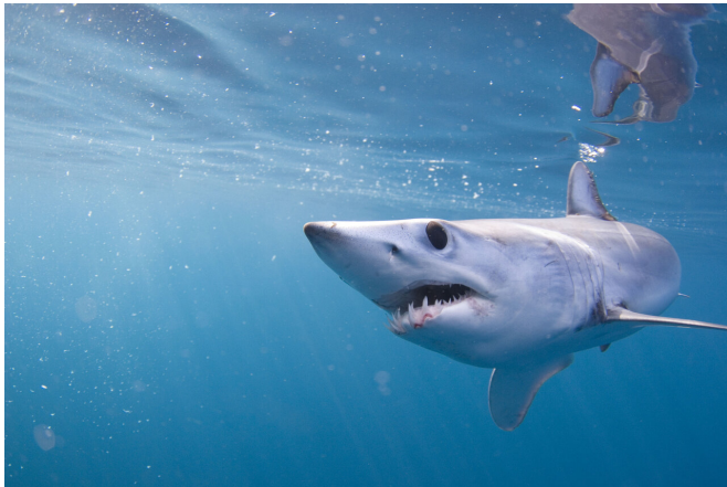
Juvenile shortfin mako shark swimming in the waters off California.

The largest effort ever to tag and track shortfin mako sharks off the West Coast has found that they can travel nearly 12,000 miles in a year. The sharks range far offshore, but regularly return to productive waters off Southern California, an important feeding and nursery area for the species.