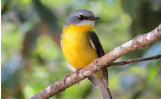
An Eastern Yellow Robin ( Eopsaltria australis ). More than 60 per cent of the birds of south-east mainland Australia have lost more than half of their natural habitat.

through loss of habitat has implications for the health of ecosystems.