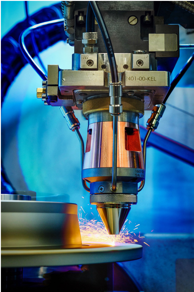
Coating a brake disc with the EHLA process.

More than many other auto parts, brake discs are subject to repeated mechanical loads. As a result of this continual abrasion, they produce fine particulate matter, which pose a substantial environmental burden. Now, however, a new coating process developed by the Fraunhofer Institute for Laser Technology ILT and RWTH Aachen University can significantly reduce this impact. By using "Extreme High-speed Laser