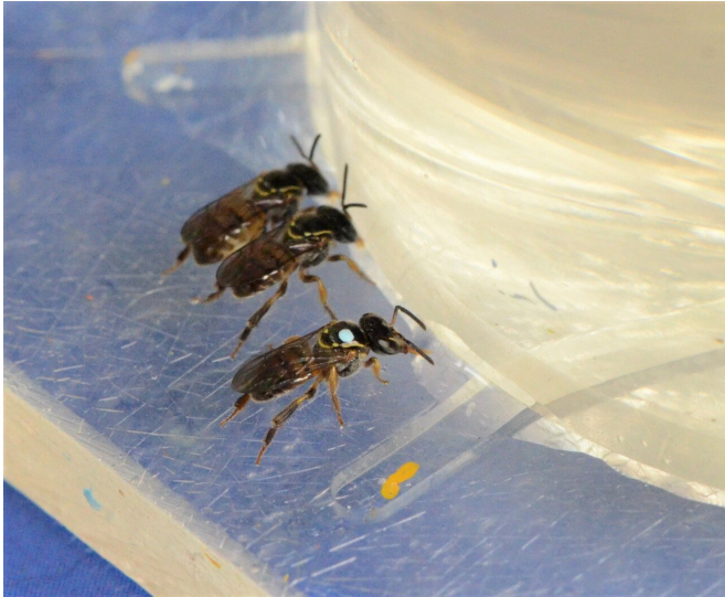
Stingless bees of the species Plebeia droryana , just 3 millimeters in size, collecting solution from a dispenser photo. Credit: Christoph Grüter

The western honey bee ( Apis mellifera ) that has a sting for use in defense is common in Western Europe. Stingless bees, on the other hand, are mainly at home in the tropics and subtropics. They are a very social group and live in colonies. They construct hives where they store honey for their colony. While the western honey bee reacts to the presence of caffeine in nectar and pollen and becomes more active in terms of foraging the corresponding food source, it would seem that stingless bees find caffeine to be less appealing. "We looked at stingless bees in Brazil but found there was no effect when we offered them caffeinated feeds," said Dr. Christoph Grüter of Johannes Gutenberg University Mainz (JGU). "In the context of our study, the behavior of the insects was not influenced by the presence of caffeine." Some plants add caffeine or other secondary metabolites to their nectar with the aim of manipulating the activity of pollinators. The western or European honey bee and the bumblebee are indeed susceptible to this form of deception. They