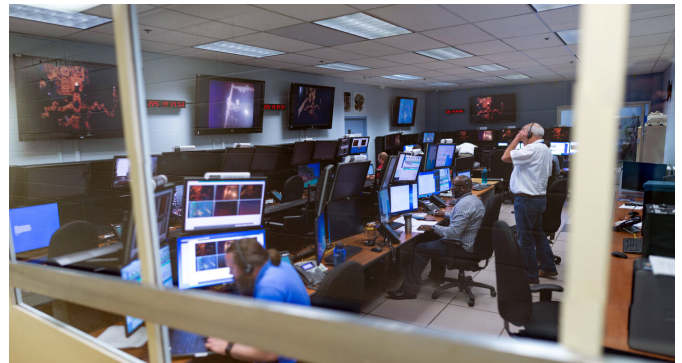
The RRM3 team manages operations from the Goddard Satellite Servicing Control Center at NASA's Goddard Space Flight Center in Greenbelt, MD.

RRM3 launched to the International Space Station in December 2018. While the mission is no longer capable of transferring liquid methane due to a hardware issue in April, it has achieved several objectives. RRM3 demonstrated the longest storage of a cryogen without loss due to a process called boil off. Boil off is a loss of fluid that occurs when the cryogen is not maintained at a low enough temperature. Special coolers within RRM3 kept the liquid cold for four months.