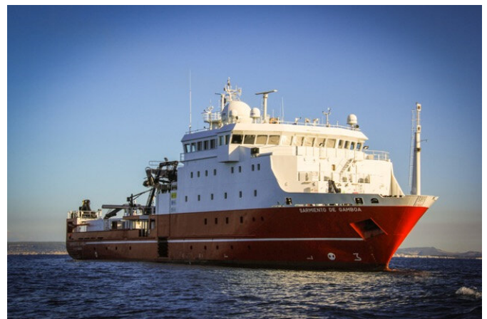
Research vessel "Sarmiento de Gamboa", in which the research team collected seawater samples for this study.

So far, computer simulations of what global warming could be like in the future do not yet account for this microbial shift.