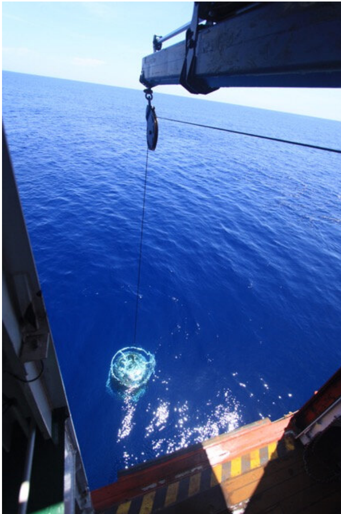
Seawater sampling in the Mediterranean Sea.

Rhodopsins were discovered 20 years ago, and scientists at USC and elsewhere have been studying their prevalence and metabolism since. These microbes have light-sensitive protein systems in their cell membranes that trap sunlight, an adaptation analogous to how rods and cones in the human eye gather light.