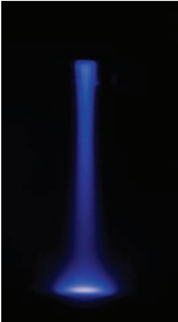
This particle beam polishes the surface of a new X-ray optic made of silicon.

His goal—given the cost of building space observatories, which only increase in price as they get larger and heavier—was to develop easily reproducible, lightweight, super-thin mirrors, without sacrificing quality.