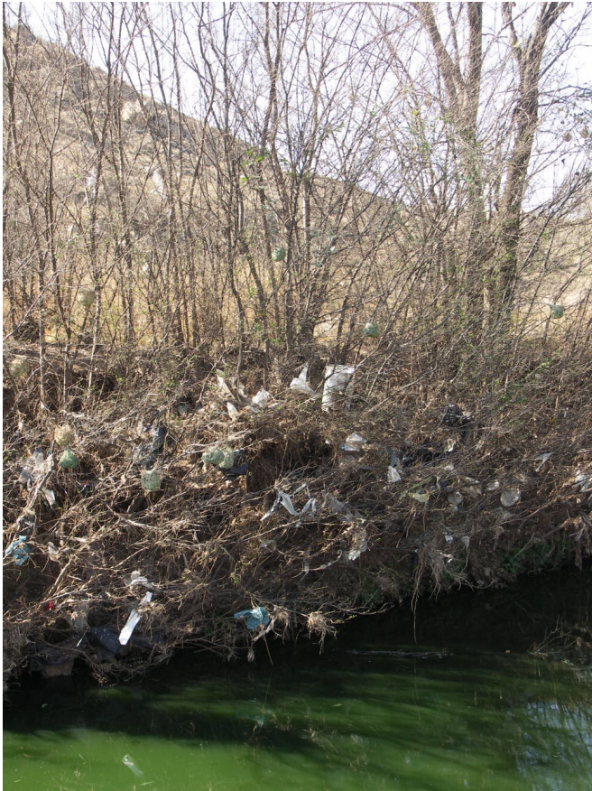
Plastic bag litter along the Jukskei River, Johannesburg, South Africa.

Single-use plastics are a blessing and a curse. They have fueled a revolution in commercial and consumer convenience and improved hygiene standards, but also have saturated the world's coastlines and clogged landfills. By one estimate 79 percent of all plastic ever produced is now in a dump, a landfill or the environment, and only 9 percent has been recycled .