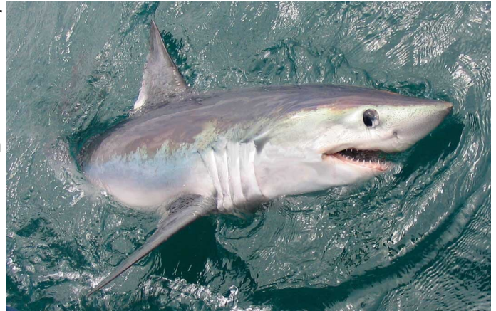
Porbeagle shark off the UK coast.

Equally alarming was that shark hotspots showing high overlap with longline fishing were often also subjected to high fishing effort, a potential "double whammy" for sharks that will result in higher catch rates and potentially accelerate declines in abundance.