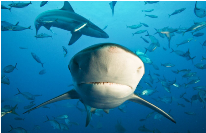
Bronze whaler shark.

Even the remotest parts of the ocean appear to offer highly migratory sharks little refuge from industrialized fishing fleets, according to a major new international study published in the journal Nature .