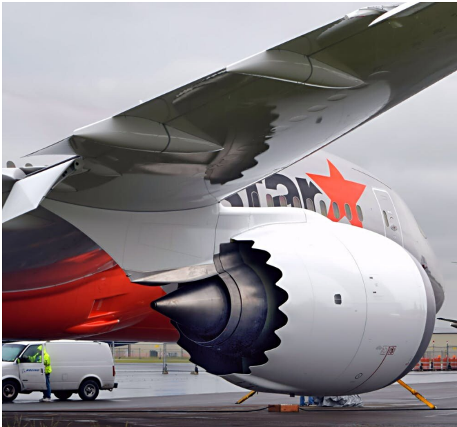
The chevron shapes around the engine's exhaust nozzles reduce aircraft noise.

aircraft. Second, for many years after their initial reintroduction, the total number of supersonic aircraft departing any airport will be a small fraction of all traffic. For example, a study conducted for Aerion indicated potential sales of 30 supersonic aircraft a year for 20 years in the small business market. Regulations should accommodate both what supersonic aircraft technology can reasonably deliver and what airport communities will tolerate.