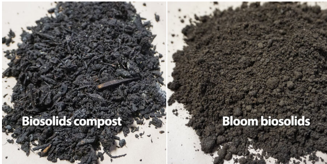
Biosolids compost (left) shows the presence of woody material mixed in during the composting process. Bloom biosolids product (right) shows the product's dry, crumbly texture.

The "zero waste" trend could have a friend in the form of biosolids. Biosolids are the materials produced after domestic waste is treated in urban wastewater systems. In the past, most of this solid material was transferred to landfills. But, processes developed over the past few decades can create "exceptional quality" biosolids.