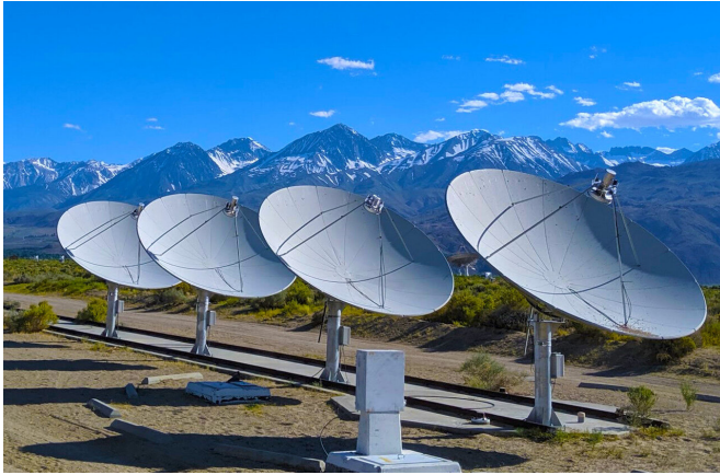
Owens Valley Radio Observatory.

Fast radio bursts (FRBs) are among the most enigmatic and powerful events in the cosmos. Around 80 of these events—intensely bright millisecond-long bursts of radio waves coming from beyond our galaxy—have been witnessed so far, but their causes remain unknown.