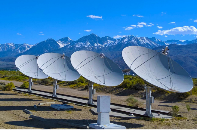
Owens Valley Radio Observatory.

Fast radio bursts (FRBs) are among the most enigmatic and powerful events in the cosmos. Around 80 of these events—intensely bright millisecond-long bursts of radio waves coming from beyond our galaxy—have been witnessed so far, but their causes remain unknown.