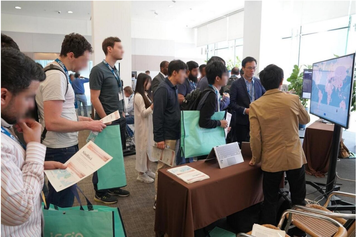
Demonstrating SimBlock at IEEE ICBC 2019

SimBlock can currently simulate the parameters of Bitcoin, Litecoin, and Dogecoin, mirroring blockchain network size, block generation interval, and communication speed over the Internet. Users can see what changes to node behavior do to a blockchain network by modifying Java code in SimBlock. It is also possible to modify parameters of the blockchain and communication speed.