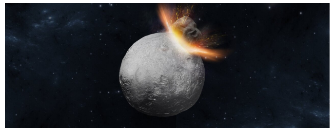
Artist's concept of a massive 'hit-and-run' collision hitting Asteroid Vesta. Credit: Mikiko Haba

The team then took a close look at the crystals in the mesosiderites. They estimated that the silicates formed approximately 4.55 billion years ago, and that the mixing of the metals occurred approximately 4.52 billion years ago.