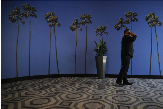
In this May 4, 2018, file photo a man talks on the phone in a hallway adorned with the palm tree-printed wallpaper at a hotel near the Los Angeles International Airport in Los Angeles. New tools are coming to help fight robocall scams, but don't expect unwanted calls to disappear.

FCC Chairman Ajit Pai believes phone companies will have an incentive to step up and offer these services for free.