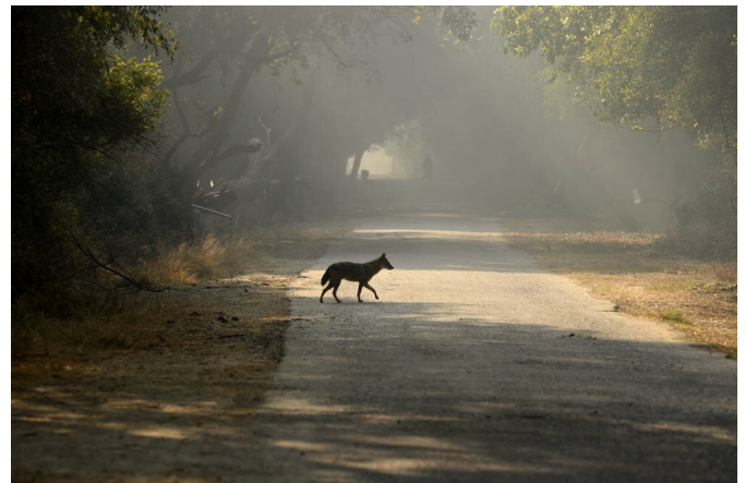
Golden jackal Canis aureus crossing the road in Keoladeo National Park, India.

While there is debate over the relative impacts of loss and fragmentation on biodiversity, we know that it can have longlasting effects on everything from the amount and persistence of species within different areas, to community composition. And now our newly published research has shown that loss and fragmentation changes the way species within biological communities actually interact well before extinctions are detected. This has a serious effect on the stability of whole communities.