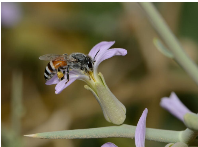
An example of a mutual interaction: dwarf honey bee Apis florea worker forages on Zilla spinosa .

Since Janzen's work, researchers have been looking for recurrent patterns in how networks of ecological interactions respond to habitat destruction. These networks link all species interactions within communities into a single web. For example, in a food web, when a predator eats a prey, this can have consequences for the resources used by the prey.