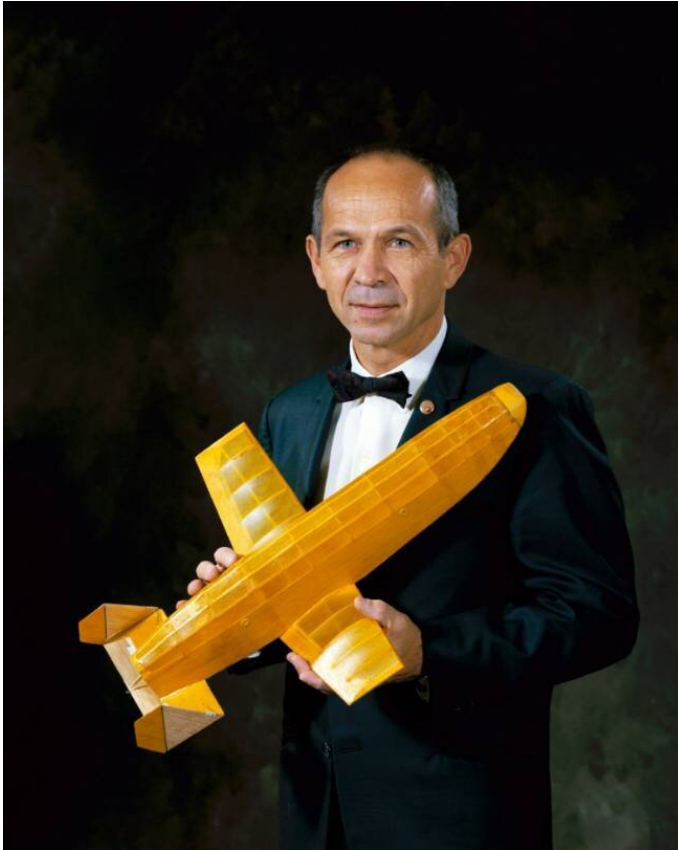
Max Faget