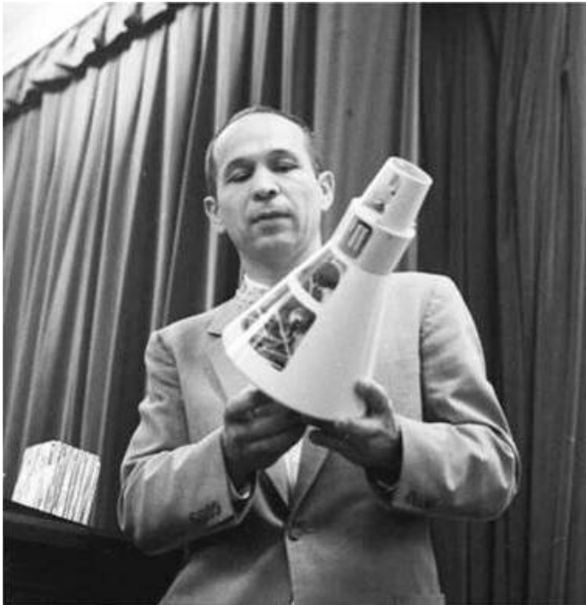
Max Faget

Apollo 11 Astronaut Neil Armstrong is rightfully remembered for taking man's first steps on the moon nearly 50 years ago on June 20, 1969. Less well known, perhaps, is LSU Mechanical Engineering alumnus Maxime "Max" Faget, who designed the spacecraft responsible for that "giant leap for mankind."