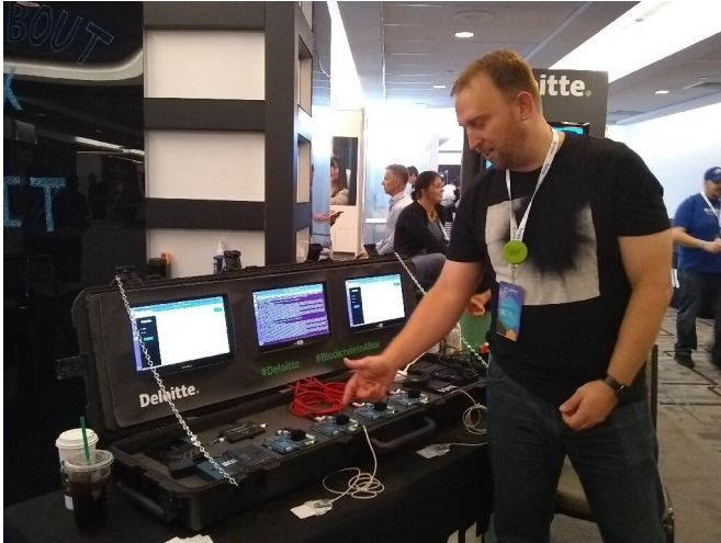
Deloitte demonstrated blockchain-based cybersecurity technology at the Consensus 2019 conference in New York on May 15, 2019

The vibe at a gathering this week for blockchain enthusiasts felt decidedly less exuberant than its predecessor a year ago after dizzying swings in bitcoin.