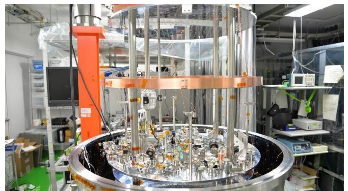
Vibration isolation stage and vacuum tank.

Development of such a gravity sensor will pave the way for a new class of experiments where gravitational coupling between small masses in quantum regimes can be achieved.