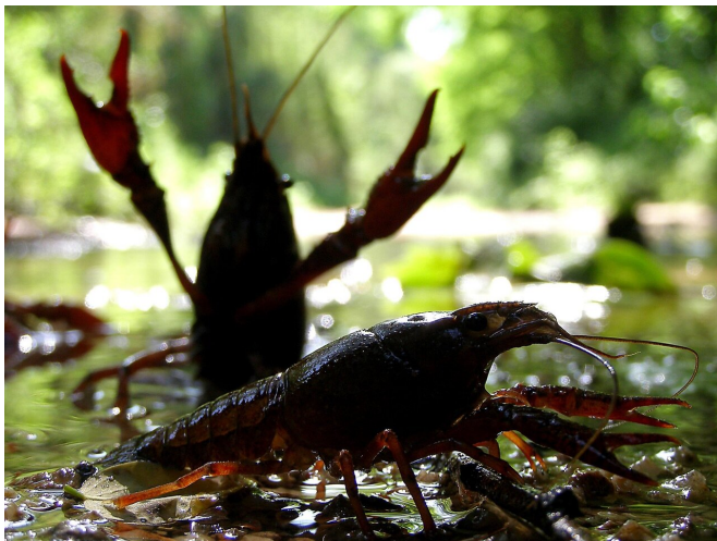
Red swamp crayfish specimens.

Spanish National Research Council (CSIC) researchers have reconstructed the invasion routes followed by the red swamp crayfish during its human-driven expansion based on the analysis of a mitochondrial gene (COI), which was sequenced from 1,412 crayfishes from 122 populations across the Northern Hemisphere.