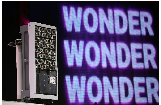
An antenna for the ultra-fast 5G mobile network

In the real world, that brings into play the possibility of factory robots being operated remotely or surgeons operating on patients from far away using augmented reality glasses.