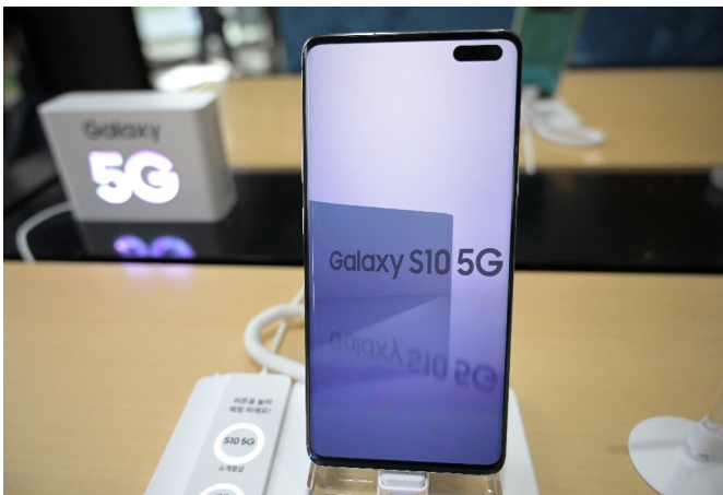
A Samsung Galaxy S10 5G smartphone displayed at a telecom shop in Seoul last month

Huawei says it offers better technology at a lower cost. The Chinese leader, however, is hitting hurdles in the global race.