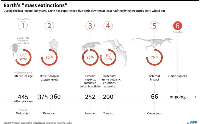
Graphic on Earth's "mass extinctions" during the last 500

But the 1992 Convention on Biological Diversity (CBD) has always been a poor stepchild compared to its climate counterpart, and the IPBES was added as an afterthought, making its authority harder to establish.